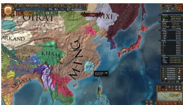
Eu4 wiki ming disaster. Eu4 ming horde disaster. Eu4 worst disasters. Eu4 ming disaster mandate of heaven. Eu4 ming disasters. Eu4 ming not collapsing. Eu4 ming dynasty disaster. Eu4 how to deal with ming.